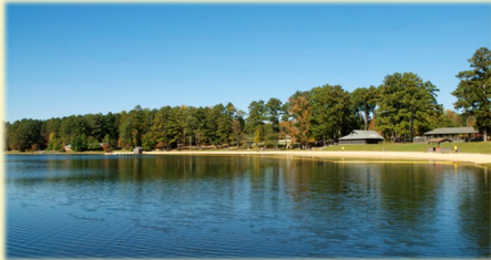
John Tanner State Park, Carrollton, GA